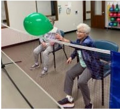
A new activity called chair volleyball was enjoyed in February. We'll play it again in March with a beach ball! Come join us!