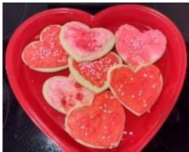
Cookies made by the tenants!

The Central Iowa Christian School kids visited the Hammond Center in February! The tenants made valentines for the kids and the kids sang and danced for the tenants. We always look forward to their visits!